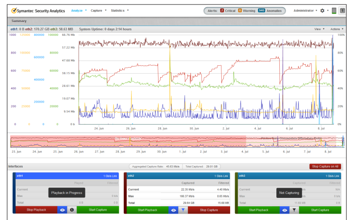
Figure 3. Full packet capture and meta data enrichment