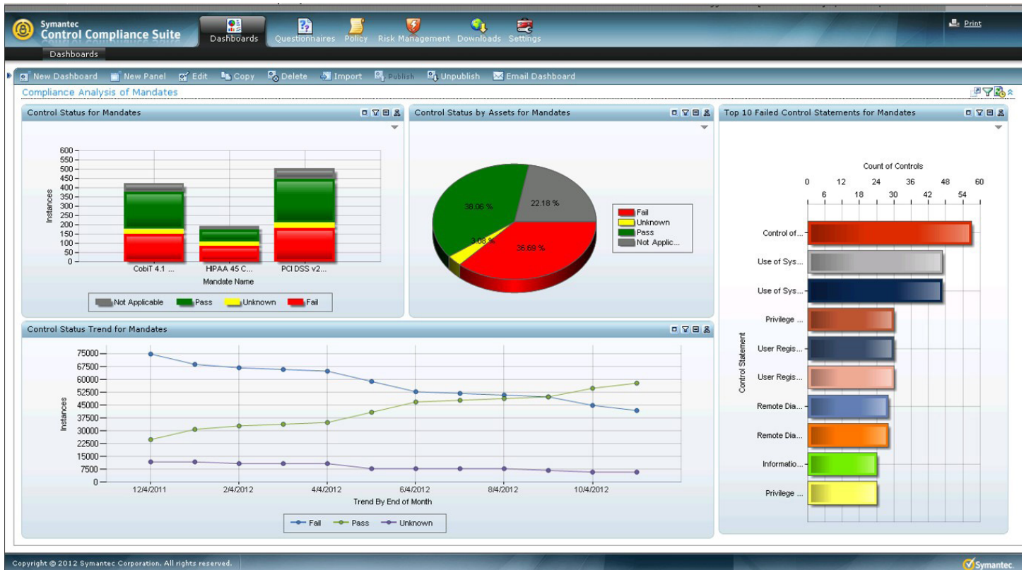
Figure 3: You can easily assess compliance for multiple mandates and overall compliance for all organizational controls.